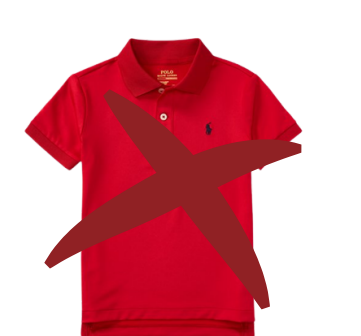
NO Non-School branded polos/t-shirts *with the exception of special dress down or spirit days.