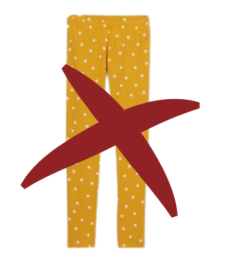
NO leggings or tights as a replacement for pants