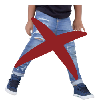
NO jeans of any kind