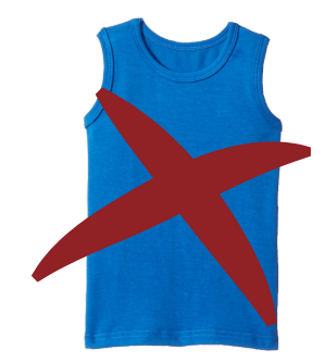
NO tank tops of any kind

The following are items NOT permitted as outlined in our dress code policy. For a list of permitted items please refer to Page 3 .